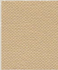
719 Tan (13oz) 719-LT Tan (8oz)