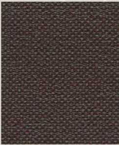
779 Chocolate Brown (13oz) 779-LT Chocolate Brown (8oz)