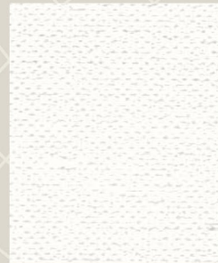
765 White (13oz) 765-LT White (8oz)