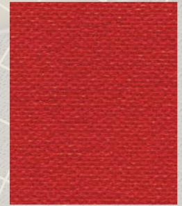
736 Red (13oz) †* 736-LT Red (8oz) †*