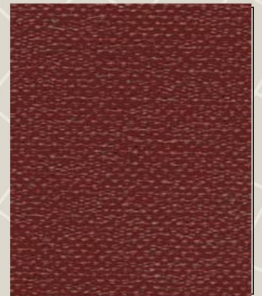
776 Burgundy* (13oz) 776-LT Burgundy* (8oz)