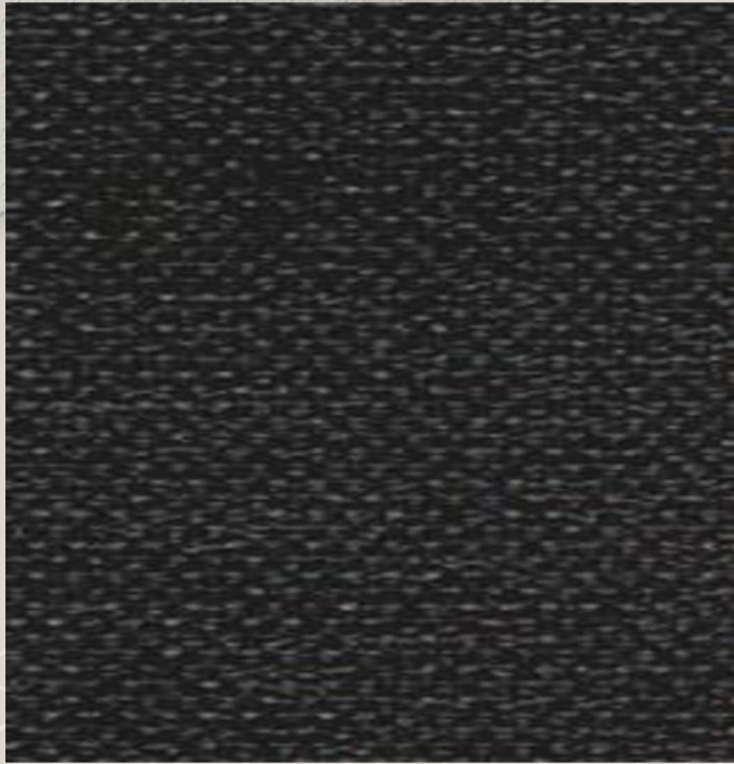
751 Raven Black (13 oz) 751-LT Raven Black (8 oz)

8 and 13 ounce Acrylic Coated Flame Retardant Polyester