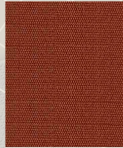
743 Terra Cotta (13oz) 743-LT Terra Cotta (8oz)