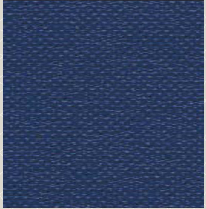
710-LT Royal Blue* (8 oz) 710 Royal Blue* (13 oz)