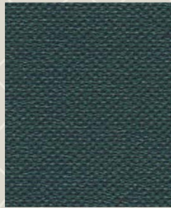
740 Hunter Green* (13oz) 740-LT Hunter Green*(8oz)