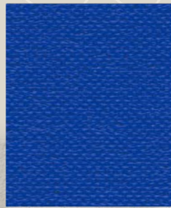
731 Ocean Blue (13oz) 731-LT Ocean Blue (8oz)