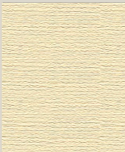
707 Ivory (13oz) 707-LT Ivory (8oz)